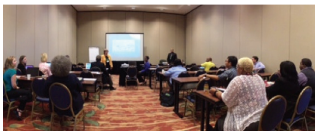
CUP staff and faculty evaluators facilitate a workshop at the University System of Georgia Adult Learning Consortium's Summer Institute.

Current research shows that adult learners are more likely to enroll in, persist in, and complete postsecondary programs when institutions recognize students' prior learning, including ACE credit recommendations for corporate and military training. ACE's College and University Partnerships (CUP) and its regional liaisons help institutions build credit-for-prior-learning policies and practices. Through webinars, workshops, and other technical assistance, CUP staff and liaisons help colleges and universities map ACE credit recommendations to specific degree programs and collaborate with employers and other organizations to support adult learners' completion of postsecondary credentials.