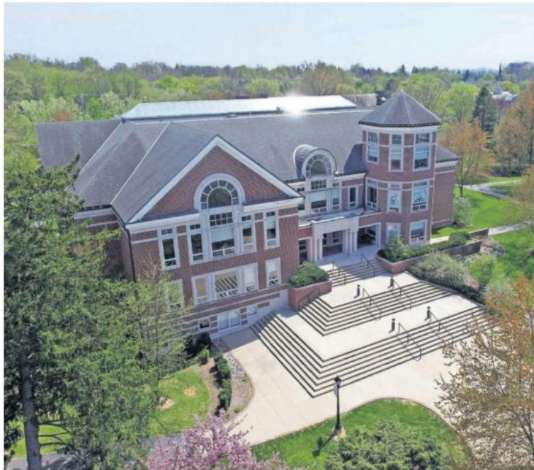
Schools across central Pennsylvania, including Elizabethtown College in Lancaster County, play a pivotal role in educating military veterans and supporting national defense.

American nuclear submarines couldn't be built without the nearly 600 vital industrial suppliers here in Pennsylvania. And the top seven defense contractors in the United States have offices in Pennsylvania. It's no wonder why the secretary of the Navy gave a shoutout to Pennsylvania when dedicating the USS Harrisburg, stating, "The people of central Pennsylvania have always played a critical role in forging the strength of our Navy and fighting to defend our nation."