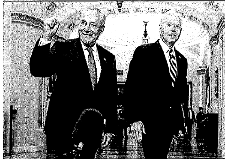
President Joe Biden (right) joins Senate Majority Leader Chuck Schumer and fellow Democrats at the U.S. Capitol to discuss the latest progress on his infrastructure agenda.