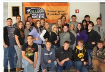
These seniors at Southern High School participated in last year's college application event.