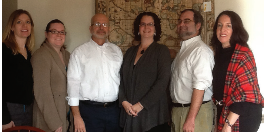
Juniata College's (PA) Intercultural Learning Assessment Committee—one of the institution's three internationalization-focused committees.

Step #7 (or, better yet, Step #1): Participate in ACE's Internationalization Laboratory