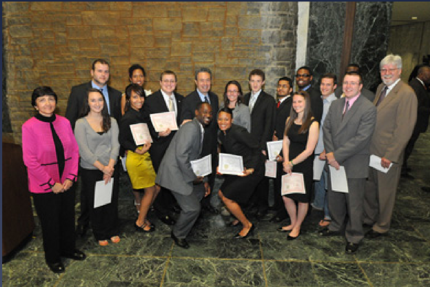
2009 Session—Research Paper Winners