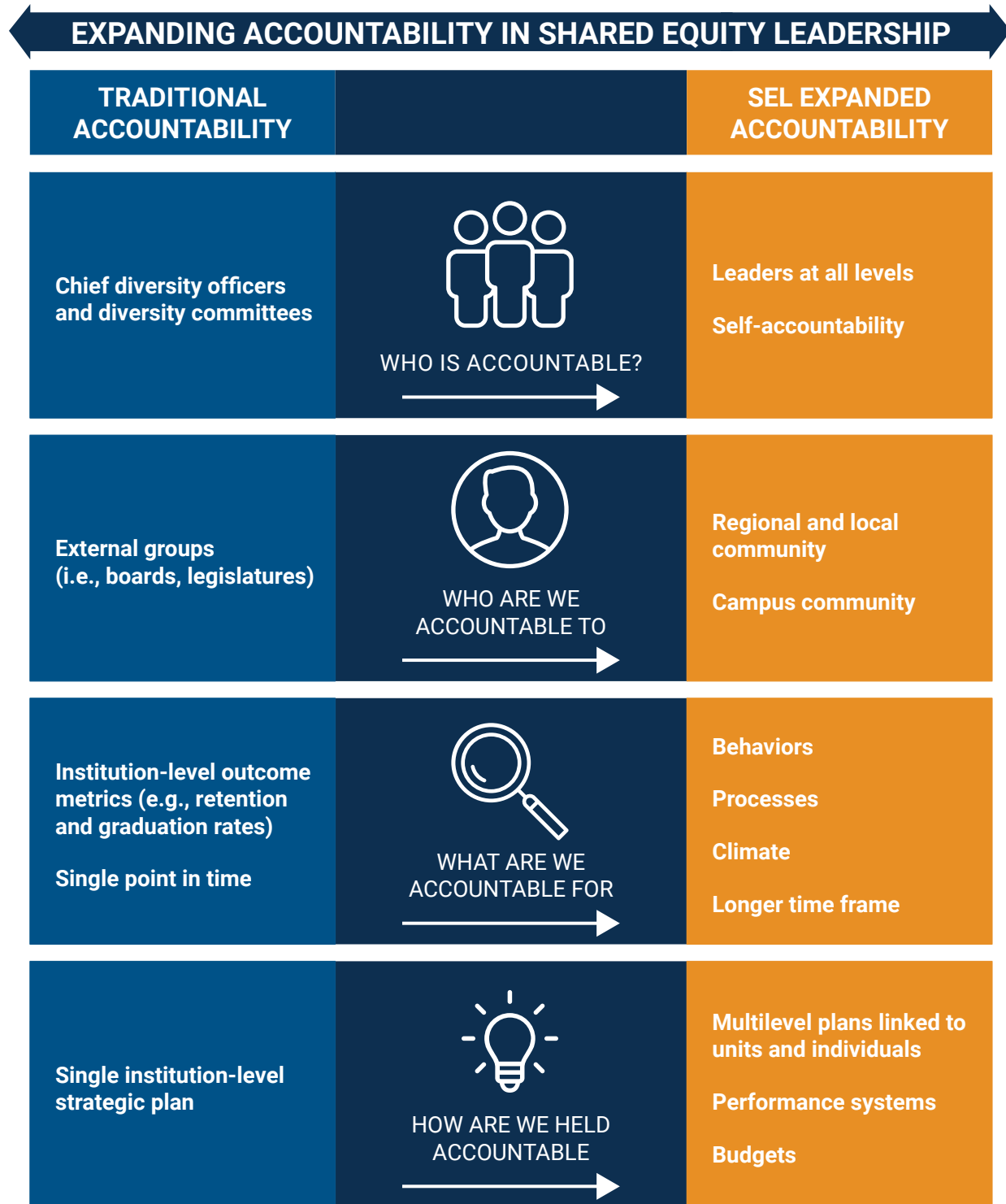
FIGURE 2: EXPANDING ACCOUNTABILITY IN SHARED EQUITY LEADERSHIP